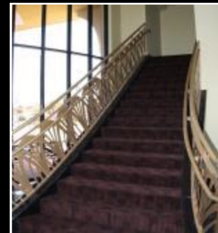
THE VILLAGE AT SPORTS CENTER SECOND FLOOR